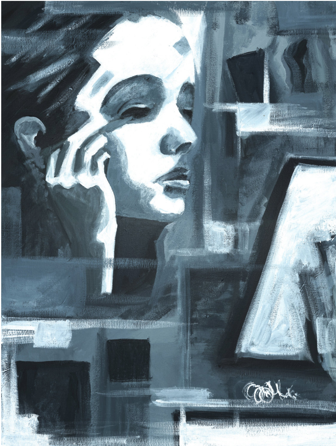
Figure 1: "Mirror" by Christine McMeekin acrylic on canvas